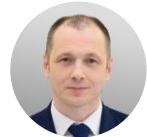
Denis Moroz Minister of Energy Belarus