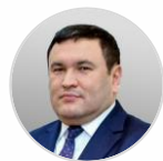
Jurabek Mirzamakhmudov Minister of Energy Uzbekistan