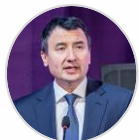
JAMSHID KHODJAEV Deputy Prime Minister of Uzbekistan

– Uzbekistan Energy Week is an important industry event. It is far more than an exhibition or conference. It is a working platform where partnerships are built, agreements are signed, technologies are presented and investors discover real opportunities. Our objective is clear: to position Uzbekistan not simply as a growing energy market, but as a reliable, modern and integrated energy partner for the region and the wider international community. I am confident that Energy Week will contribute to the launch of new initiatives, the strengthening of international cooperation, and the development of a modern, reliable and sustainable energy system.