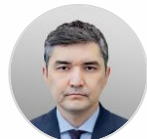
Ilyas Bakytzhan Vice-Minister of Energy Kazakhstan