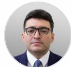
Orkhan Zeynalov Deputy Minister of Energy Azerbaijan