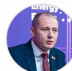
DENIS MOROZ Minister of Energy of the Republic of Belarus

– I was pleased to participate in the panel session alongside ministers from across the region. Cooperation remains critically important, particularly at a time when global crises clearly demonstrate the need for countries to strengthen resilience, diversification and flexibility. Today's session was highly productive, and I sincerely hope that Uzbekistan will join the Gas Exporting Countries Forum in the very near future.